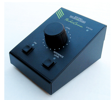
Model 71 Control Console

The Model 76DA occupies one space (1U) in a standard 19-inch rack. Digital audio sources are interfaced with the Model 76DA using nine BNC connectors. A tenth BNC connector is used by the sync source. Digital and analog monitor output signal connections are made using two 25-pin female D-subminiature connectors. One 9-pin female D-subminiature connector is used to connect the Model 76DA with up to four Model 77 or Model 71 Control Consoles. A second 9-pin female "D-sub" connector is used to interface with remote control signals. AC mains power is connected directly to the Model 76DA, with an acceptable range of 100 to 230 volts, 50/60 Hz.