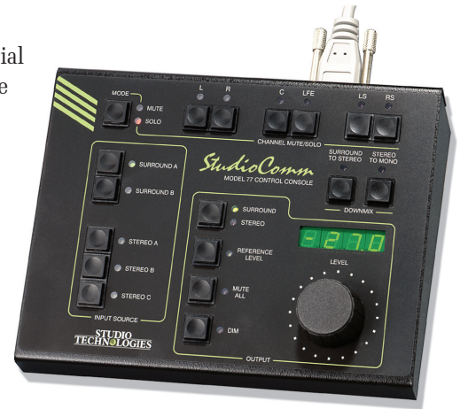
Model 77 Control Console

The core of this StudioComm for Surround system is the Model 76DA Central Controller. The one-rack-space unit contains circuitry that supports digital audio inputs, digital and analog monitor outputs, processing, and the user interface. The Model 76DA provides two surround (5.1) and three stereo digital audio inputs. These unbalanced digital inputs are AES3-compliant; sources of this type are ubiquitous in most post-production and broadcast environments. The inputs allow a sample rate of up to 192 kHz and a bit depth of up to 24 to be directly supported. Circuitry associated with one of the stereo inputs provides sample rate conversion (SRC) capability, allowing a wide range of digital audio sources to be monitored. Up to 340 milliseconds of input delay can be selected to compensate for processing delays in an associated video path. For flexibility, two delay values can be configured, allowing real-time selection as desired. A number of different signals can serve as the Model 76DA's digital